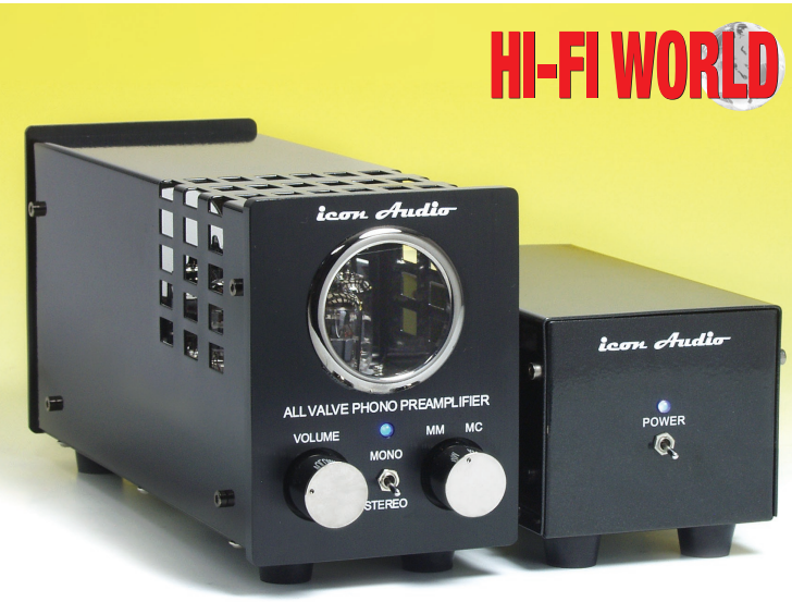
Icon Audio PS 1.2 Signature - puts a tiger in your system's tank!

Tied in terms of rankings is the Luxman E200, which is a truly esoteric device. Whilst the three previous products have all been obviously built and finished to a price, shall we say, displaying decent if prosaic production values (although the Roksan is better than the AT or Tom Evans, it must be said), living with the Luxman is like winning the lottery. All lavish brushed aluminium and lovingly finished casework in the best Japanese tradition. It sounded a bit like it looked, in a way. It's swish and svelte, but it does have a very lucid midband which is just plain enjoyable. You don't get the bright light of the Tom Evans, or the